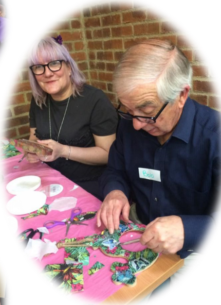
Making & selling crafts