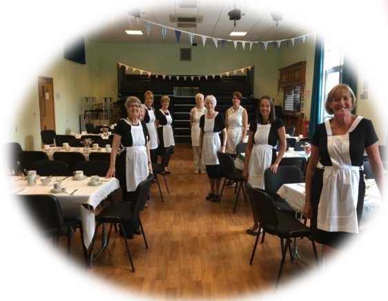
Afternoon tea party

For more information: https://crossroadsrotherham.co.uk/